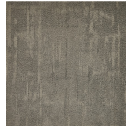
morning mistic 2