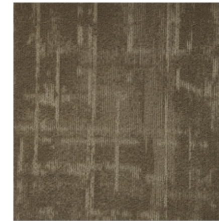
morning mistic 3